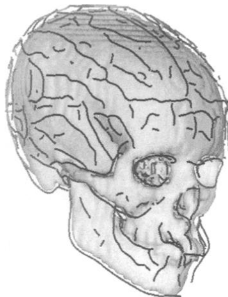
FIG. 1—External crest lines on the skull.

So far, we were able to make enough experiments only based on the second method. We present preliminary results from two sets consisting of two facial molds and two dry skulls. Face to skull registration was performed, but problems occurred due to different degrees of opening of the mandible. Furthermore, the two faces had a very different morphology. Therefore the hypothesis of close similarity of age and main characteristics of the face was not verified. Figure 2 shows the comparison between the face directly reconstructed from the skull by the computer algorithm (left), and the actual face (right), or more precisely the mold of the